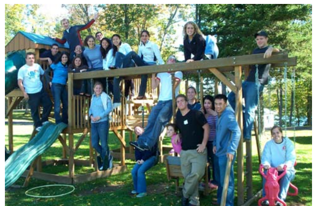
Participants of the 2004 Emerging Leaders Retreat

in which participants were able to learn about their personality preferences and understand how these preferences apply to Leadership Roles.