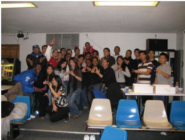
Above: MGLC New Member Social Helen Newman Bowling Lanes November 28th, 2008

On April 12th, the MGLC will be hosting the annual event known as Greek Freak where various teams of the MGLC will go and faceoff in a step competition. Top prize is $ 1000; 2nd place is $500. Other teams from other schools outside of Cornell are also allowed to participate and take home the winning prize.